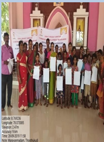
Latitude: 8.759236 Longitude: 78.073065 Elevation: 2.47m Accuracy: 9.6m Time: 28-09-2019 11:58 Note: Maravanmadam, Thoothukudi