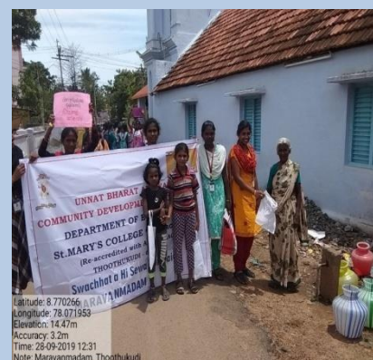
Latitude: 8.770266 Longitude: 78.071953 Elevation: 14.47m Accuracy: 3.2m Time: 28-09-2019 12:31 Note: Maravanmadam, Thoothukudi

A dengue awareness programme was conducted by II UG students of department of Psychology and Economics. The students went to each house at the village and gave 'Green